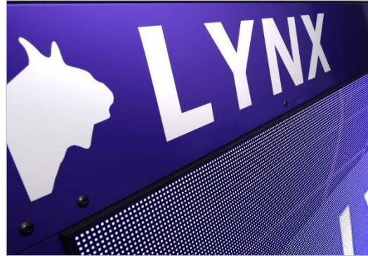
Custom-Built Aluminum Frame