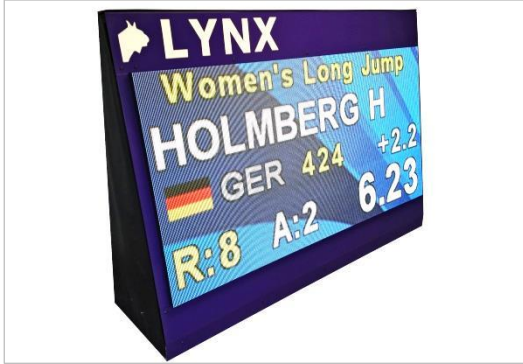
Live Field Event or Race Results