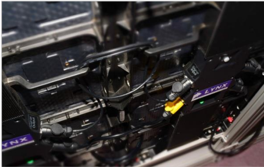
Weatherproof Internal Connections