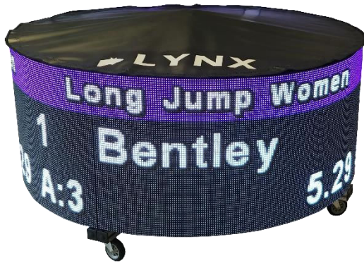
Live Event Results