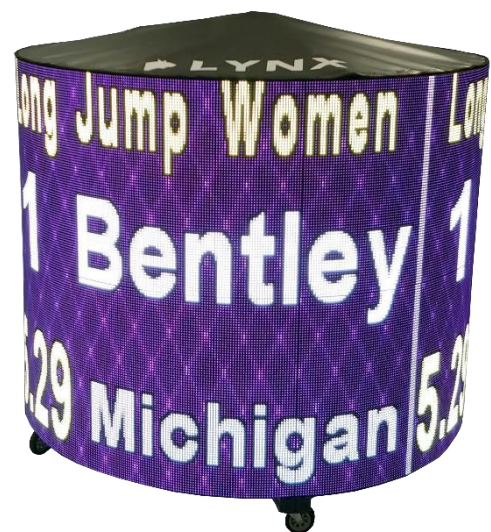
Figure 2 - Lynx 360 (double)