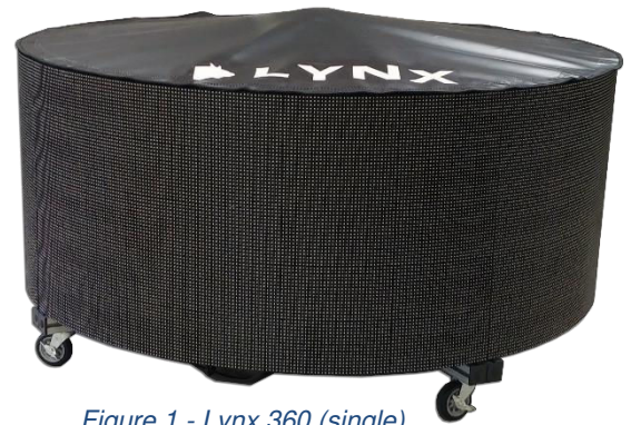
Figure 1 - Lynx 360 (single)