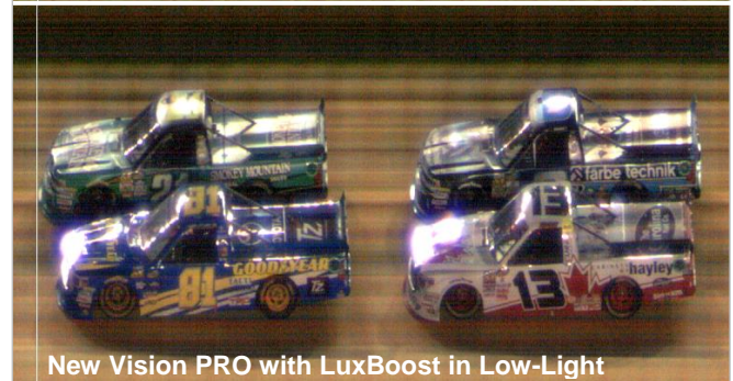
New Vision PRO with LuxBoost in Low-Light