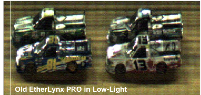
Old EtherLynx PRO in Low-Light