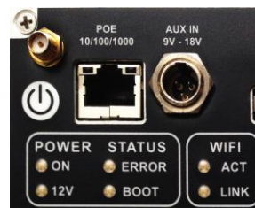
PoE or DC inputs

Optional On-Board Battery Backup: With the optional rechargeable NiMH battery pack, the software reports battery levels, and seamlessly switches to battery operation in the event of a loss of power or disconnected cable.